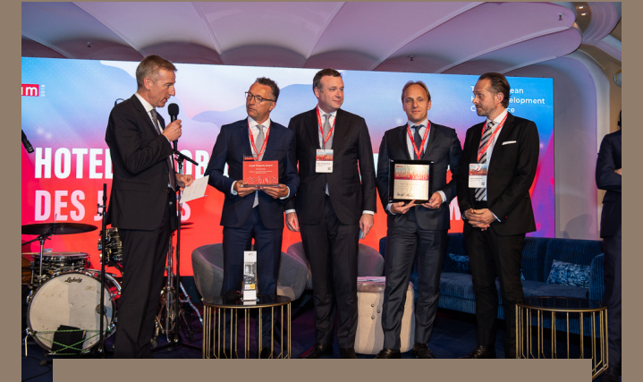
QO Amsterdam, Netherlands (2018)