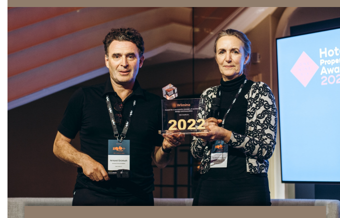
Wilmina, Berlin (2022)