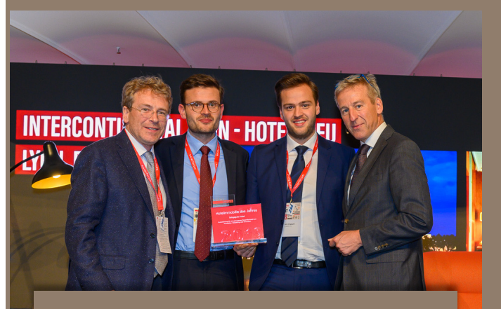
Schgaguler Hotel Castelrotto, Italy (2019)